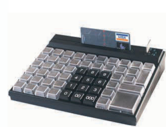
MSI 60 with MSR, Keylock and Customized numeric key set