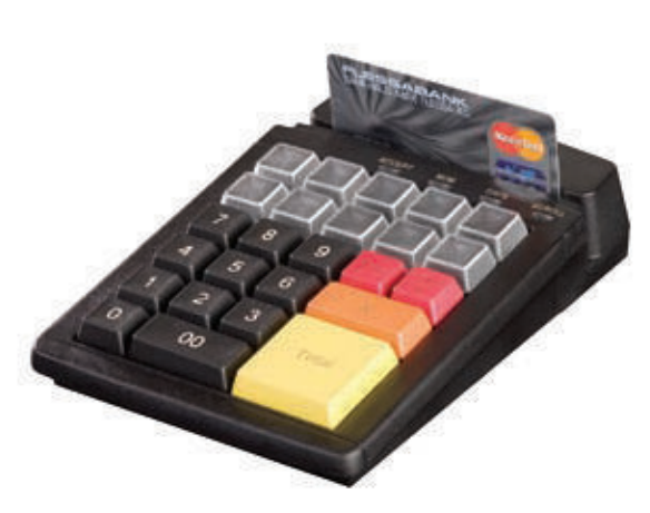
MCI 30 with MSR and Customized color keys

Ideal for high volume scanning operations where the keyboard is used primarily for tendering and PLUs. Use of double and quad keys makes this a very intuitive, uncluttered design for both new and experienced cashiers.