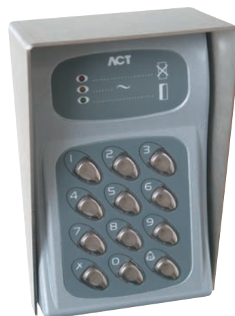
ACT 10 Weather Shield