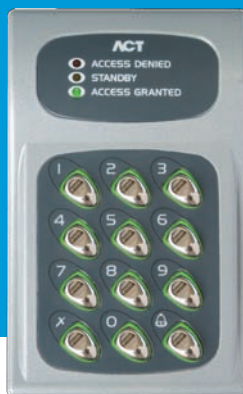
ACT 10 Digital Keypad