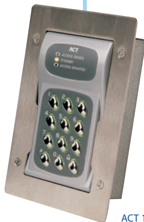
ACT 10 Flush Kit